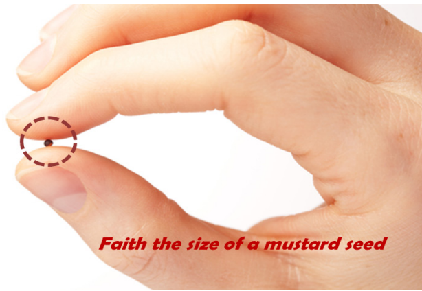
Faith the size of a mustard seed

Please note that a pdf of this Covenant News is also available online at BLDNEWARK.com