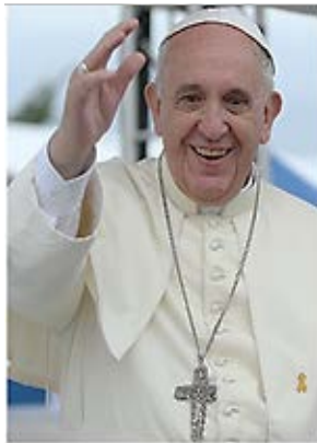
Happy 6th Anniversary of Your Election as Pontiff, Pope Francis!