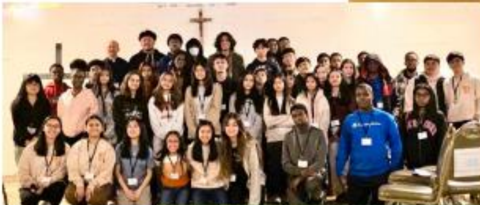
Youth LSS #26 MARCH 2023