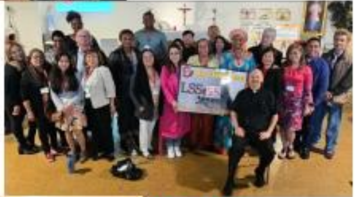
LSS #55 APRIL 2023