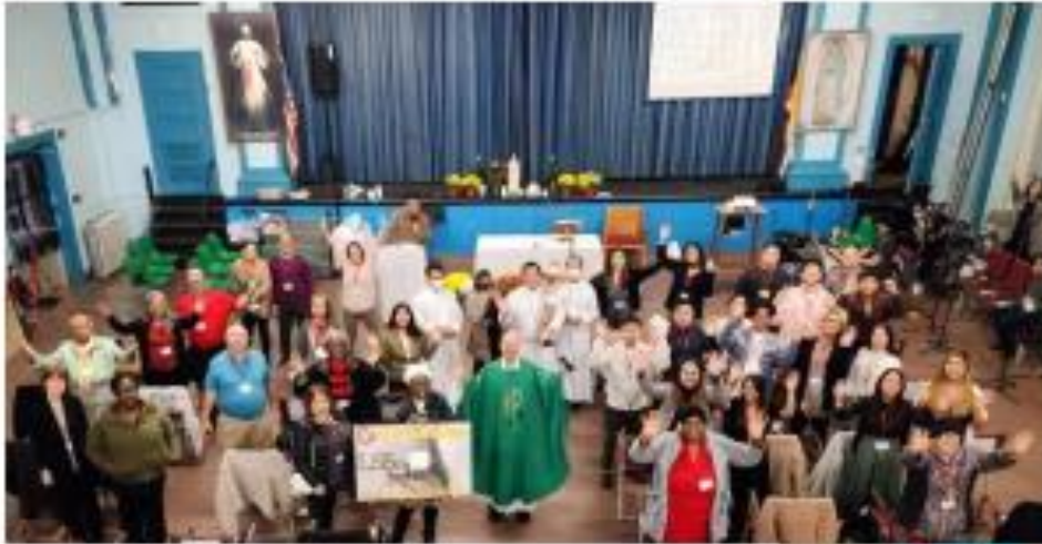
LSS #54 OCT 2022