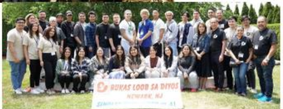
JUNE 2023 Singles Encounter #41